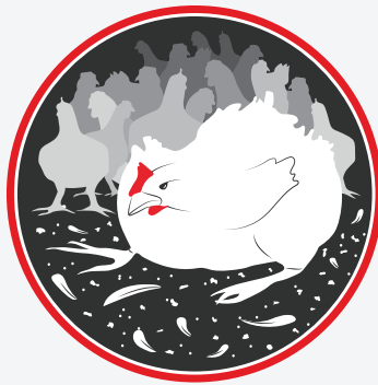
TRAPPED IN FILTH